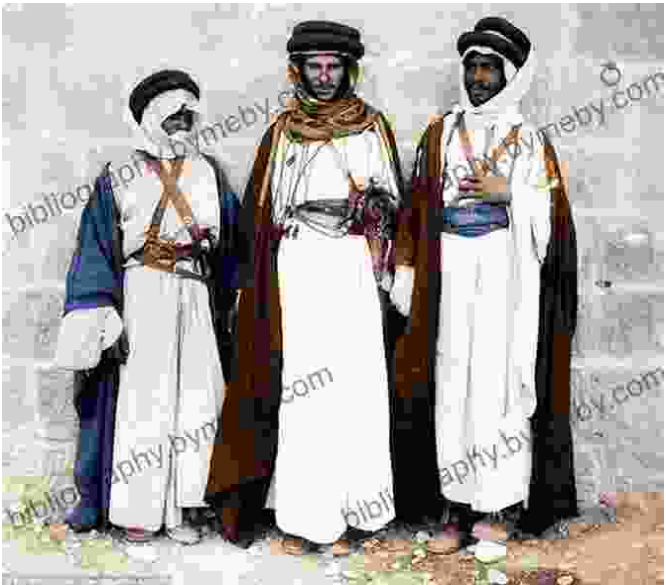
T.E. Lawrence with Arab tribesmen during the Arab Revolt.

Using his knowledge of the region and his ability to speak Arabic, Lawrence forged alliances with Arab leaders and helped to coordinate their military efforts. He played a pivotal role in the capture of Aqaba in 1917, a turning point in the revolt. Lawrence's exploits earned him the admiration of the Arab people and the respect of his fellow soldiers.