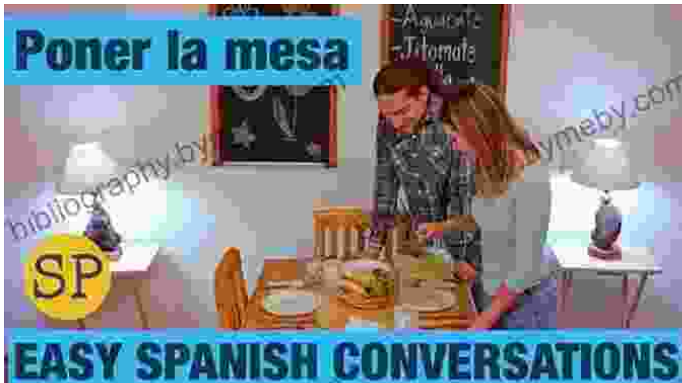
Image Caption: Immerse yourself in real-life Spanish conversations to build fluency and confidence.

Don't miss out on this opportunity to transform your Spanish communication skills. Free Download your copy of "Basic Fluency Accelerated Spanish" today and embark on your accelerated Spanish learning journey!